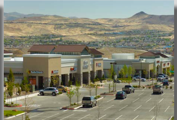
72 ACRE - SPARKS GALLERIA - 428,000 SF POWER CENTER ANCHORED BY COSTCO & HOME DEPOT