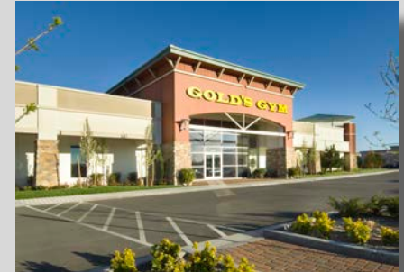
10 ACRE - LONGLEY TOWN CENTER - 112,000 SF SPECIALITY RETAIL CENTER