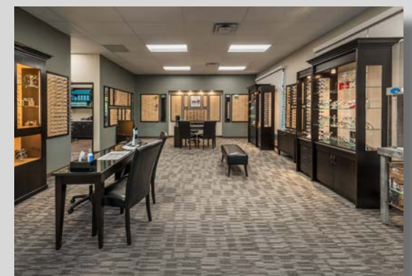
VARIOUS RETAIL BUILDINGS & INTERIORS