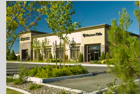
9.5 ACRE - VINEYARDS PROFESSIONAL CAMPUS - 92,000 SF OFFICE CAMPUS