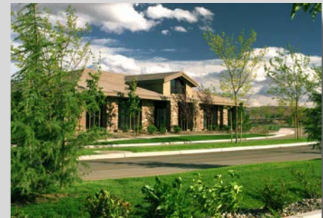
72 ACRE - RENO TAHOE TECH CENTER - 4 OFFICE CAMPUSES & TWO HOTELS - 782,000 SF