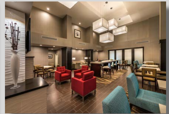
HAMPTON INN HOTEL - 86 ROOMS