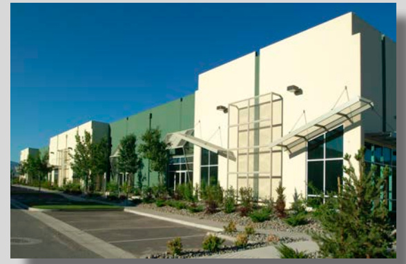
16 ACRE - FOOTHILL COMMERCE CENTER - RETAIL SHOWROOM - 212,000 SF