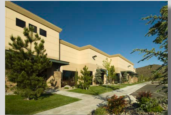
12 ACRE - SANDHILL BUSINESS CAMPUS. - FLEX OFFICE - 163,000 SF