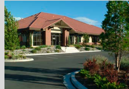
11 ACRE - DOUBLE DIAMOND PROFESSIONAL CAMPUS - 120,000 SF OFFICE CAMPUS