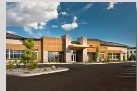
75 ACRE - RENO CORPORATE CENTER - THREE OFFICE CAMPUSES / MEDICAL CAMPUS & FLEX OFFICE CAMPUS - 556,500 SF